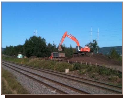
Winter Street Industrial Park